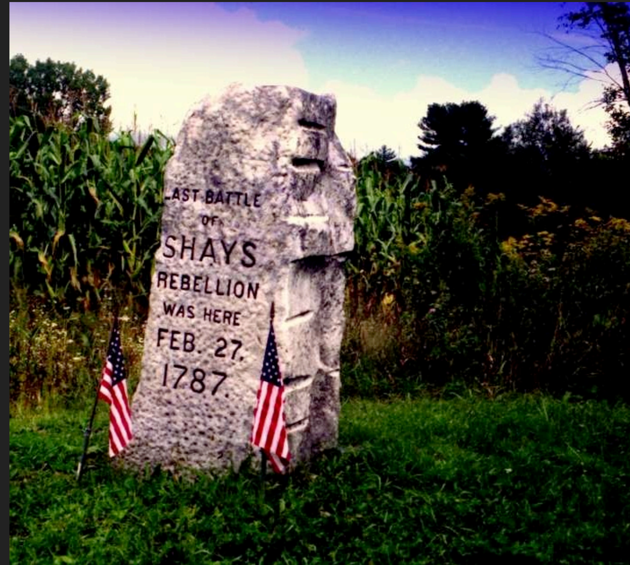
THE END OF SHAY'S REBELLION