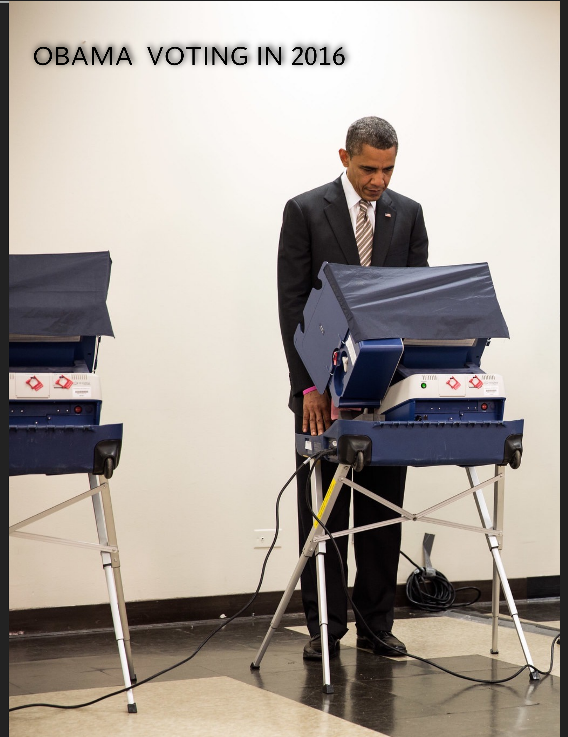
OBAMA VOTING IN 2016