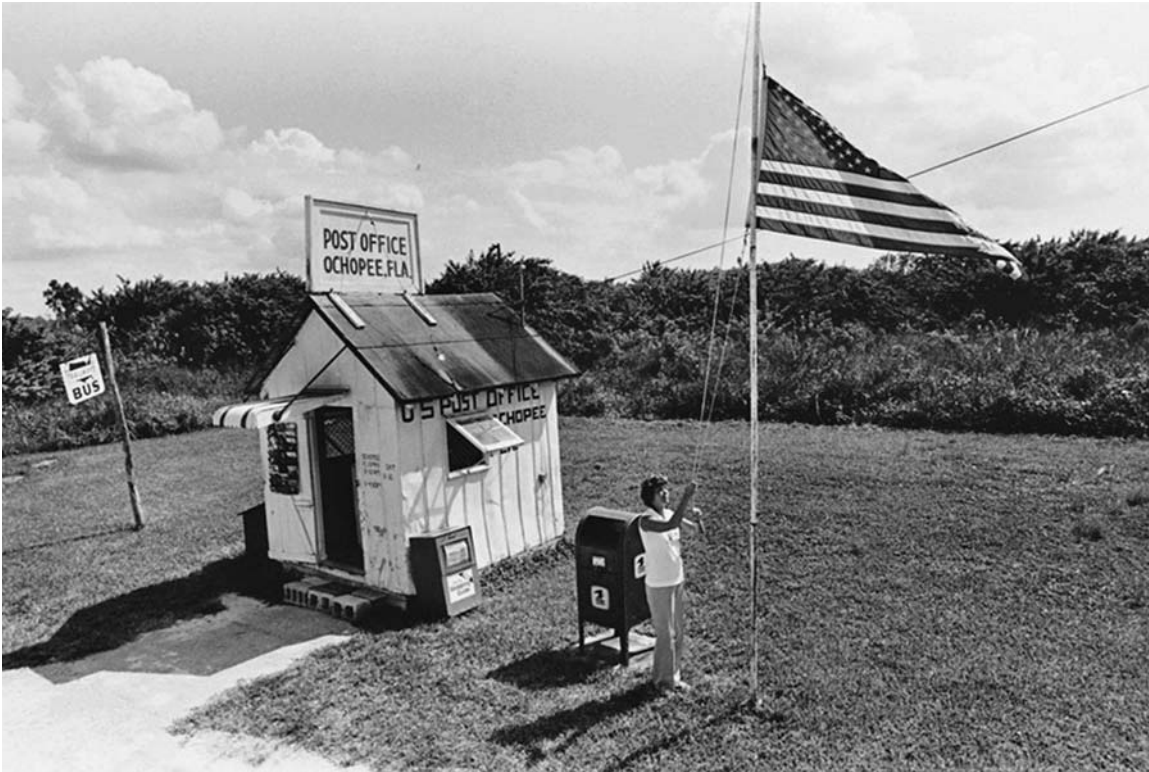
Ochopee Post Office, Florida, 1970s

The following photo, from the Web site of the United States Postal Service, shows the Ochopee Post Office, the smallest free-standing post office in the United States.